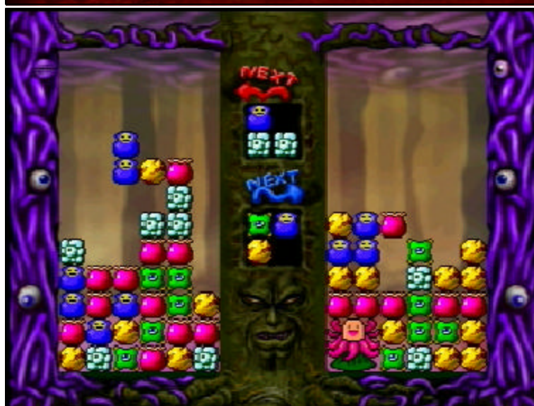
Space Hulk (top) challenges your skills against an alien menace in deep space. Trip'D (Middle & Bottom) is the perfect game for one player amusement or two player torment.